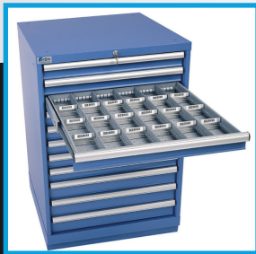
Modular Drawer Cabinets