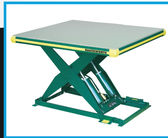
Ergonomic Lift Tables