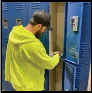
Locker Install and Repair