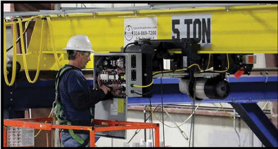
Crane Inspection and Service