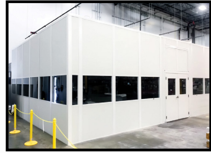
Modular Building Installation and Repair