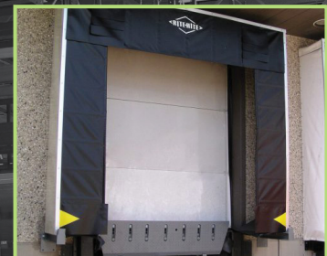
Dock Shelter Installation