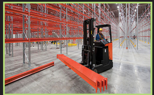
Pallet Rack Installation

Let Purdy Company handle all aspects of your project.