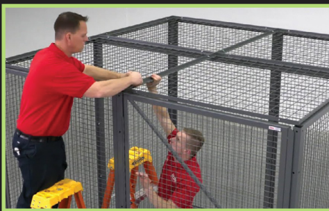
Wire Partition Installation, modification and repair

Operational focus: Outsourcing to Purdy Company allows you to stay 100% focused on your company's operational plan.