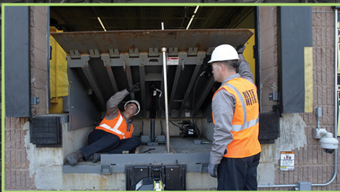
Dock Leveler Service